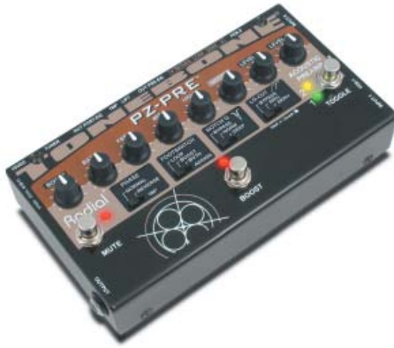
Radial PZ-Pre order # R800 7085

The Tonebone PZ-Pre™ instrument preamp begins with two inputs, selected using the toggle footswitch. Each input is equipped with a separate level control and piezo buffer with a 10meg Ohm input for optimum signal transfer. For those wishing to use two pickups on a single instrument, a unique Mix function is provided that allows the two inputs to be blended together using the level controls like a mixer. The tone shaping on the PZ-Pre features powerful low and high EQ controls plus a semi-parametric mid-range. To help eliminate troublesome feedback and low frequency resonance a variable frequency notch filter and low-cut (high pass) filter is also provided. An absolute phase reverse switch can also be engaged to help eliminate feedback on-stage.