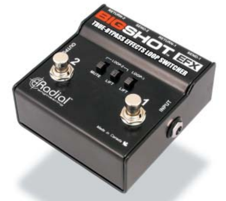
Radial BigShot EFX - order # R800 7204