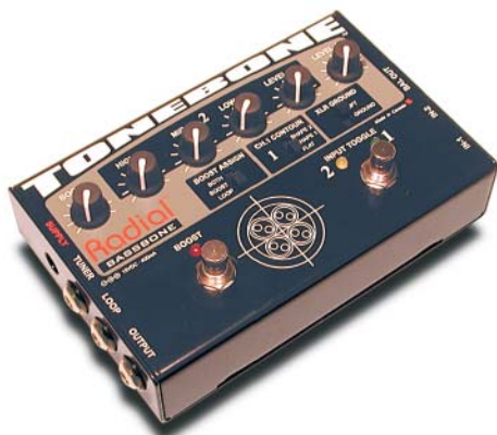
Radial Bassbone order # R800 7070

Today, most bassists have at least two basses on stage. Perhaps one is a low output vintage bass and the other, a six-string active fretless. Switching these basses during a performance would require volume and EQ adjustments on the bass amp, as each instrument is very different from the other. Up until now, the only option was to compromise amp settings... enter the Bassbone.